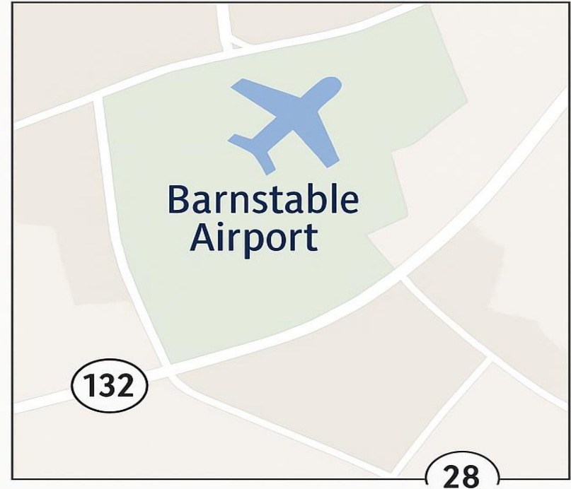
Cannabis Zoning Overlay